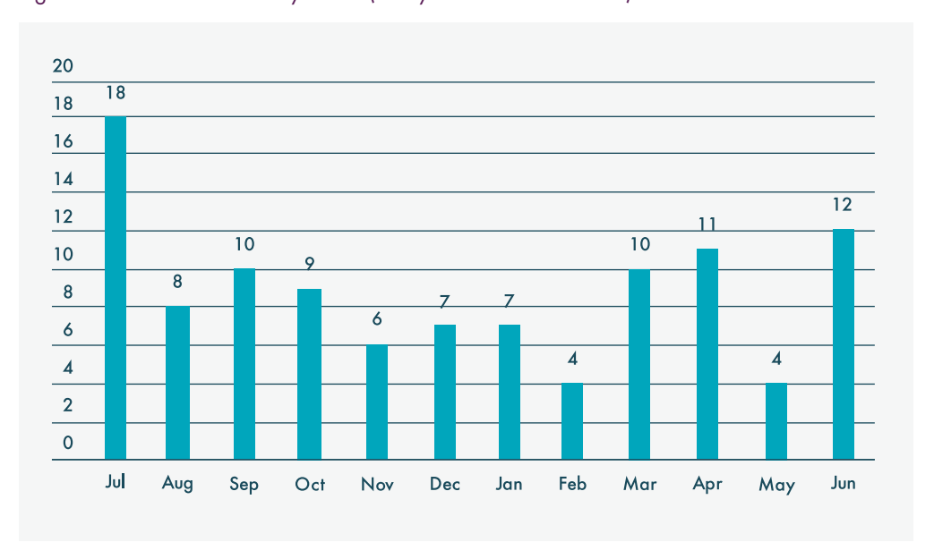
Figure 1: Number of recalls by month (1 July 2018–30 June 2019)

There were 106 food recalls coordinated by FSANZ from 1 July 2018-30 June 2019 (Figure 1). The recalls were mainly due to undeclared allergens and microbial contamination (Figure 2).